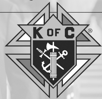
The Knights of Columbus headed up the procession for the Ordination on June 19 at the Cathedral of St. Joseph in Burlington.

The founding principles of the Knights of Columbus are charity, unity and fraternity, and men seeking to join the international charitable order founded by Blessed Michael McGivney in 1882 are encouraged to inquire about membership.