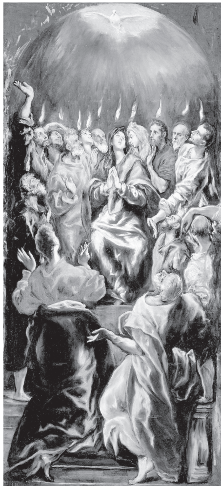
The Pentecost , by El Greco, 1597, Museo Nacional del Prado, Madrid, Spain.

The liturgy of Pentecost includes one of the more striking medieval texts in the Roman Missal, “Veni Sancte Spiritus,”